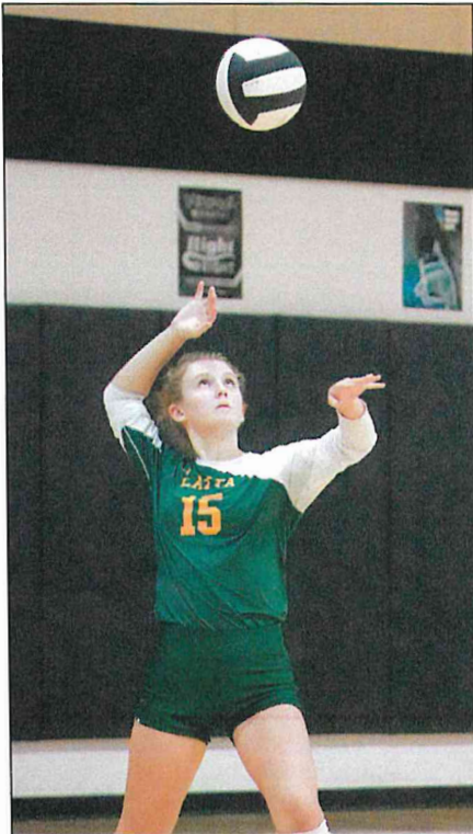
No. 15 Lady Vikings serving the ball