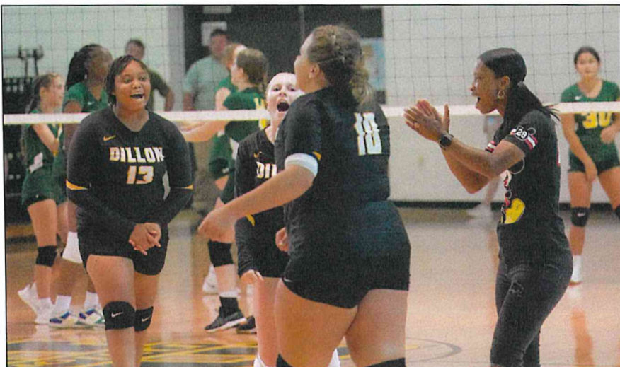
JV Lady Wildcats