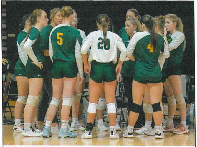
Lady Vikings during time out