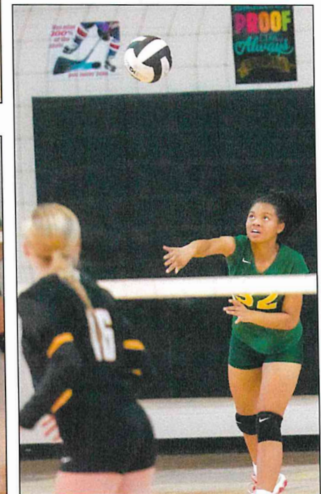
JV Lady Vikings