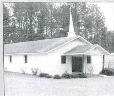
Church Of The New Beginnings 2360 Hwy 301 North, Dillon