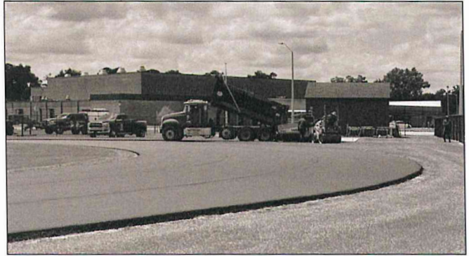
The track at Dillon High School was resurfaced on Tuesday, August 20th.

Blessed Hope Church, 2770 Highway 34 West, Dillon has service each Sunday at 11 a.m. and Wednesday at 7:30 p.m.