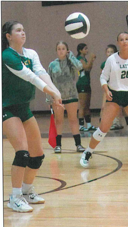
Lady Viking bumps the ball