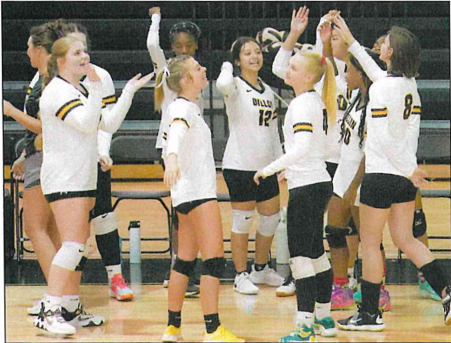
Lady Wildcats before the match